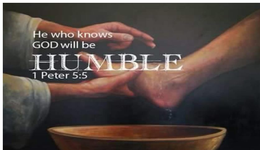
The equipment-/ministry lesson tutorial Step 7 e!

a.o: "The 5 ministries in the church"! Ephesians 4:11