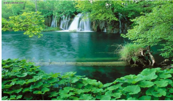
A God pleasing harts-attitude

The: “ Altar of Incense ” in the new Covenant also the Place of purified and sanctified expression before the holy and beautiful: “ Face of the Lord ”